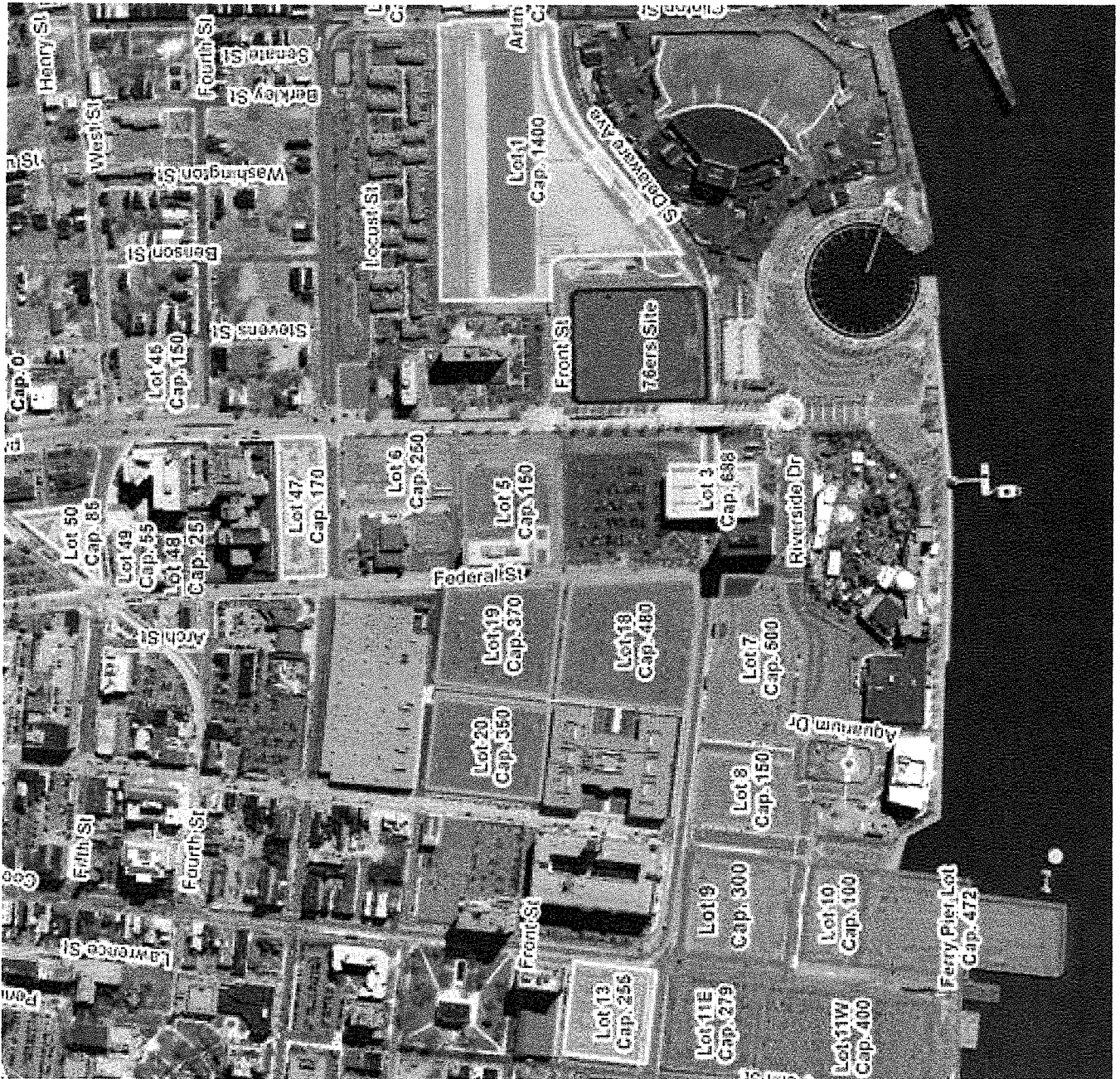
Exhibit C-1 Map of Locations for Snow/Ice Removal