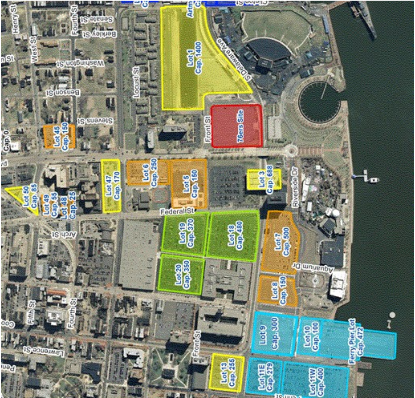
Exhibit C-1 Map of Locations for Snow/Ice Removal